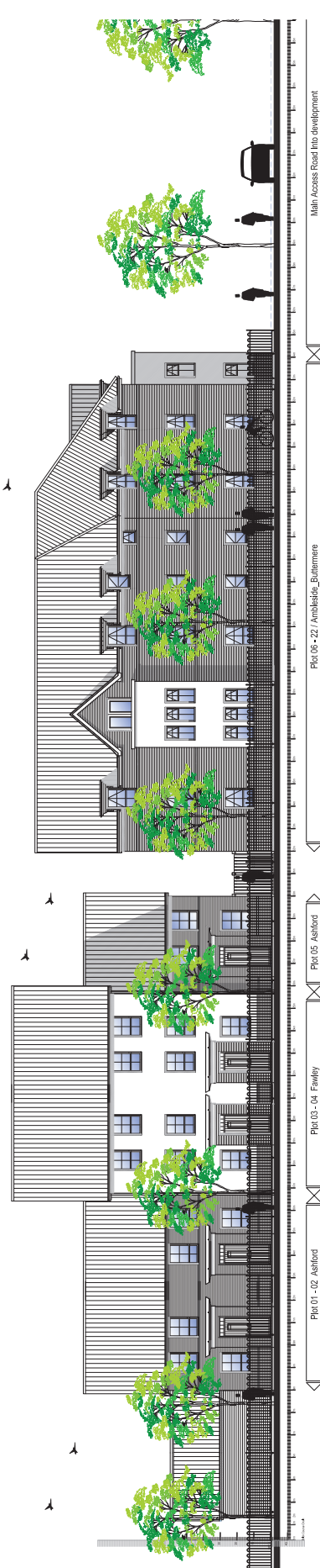
Street Scene AA

A. Updated here after planning changes: 2024.03.16